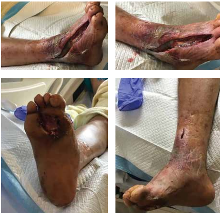
CASE 1: Postoperative result of an incision and drainage for wound salvage in a patient with necrotizing fasciitis.

It may not be until an admission to the hospital for parenteral antibiotics and limb salvage surgery with a complete medical workup that the patient is diagnosed with uncontrolled DM. In this regard, all health-care providers must be able to recognize signs and symptoms of this disease for timely diagnosis and treatment.