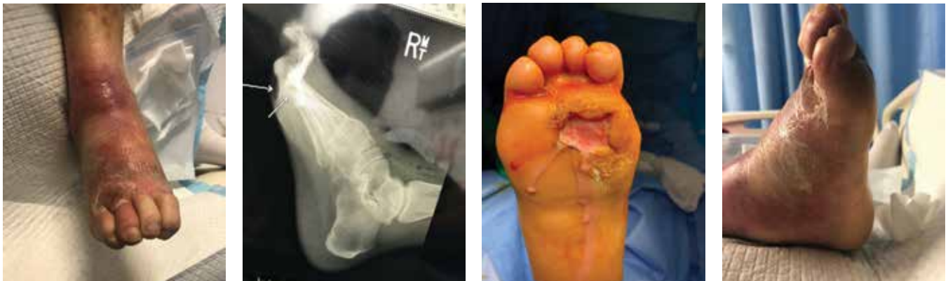
CASE 1: Preoperative presentation: A diabetic neuropathic patient presents with right foot necrotizing fasciitis originating from a foot deformity and neuropathic foot ulcer.

Oftentimes, patients present to specialty or subspecialty providers, such as podiatrists, ophthalmologists, and dentists, with secondary symptoms of DM (e.g., infections, gingivitis, visual difficulty,