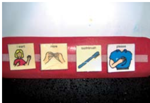
Figure 3. Picture Exchange Communication System (PECS)

Following the interview, the patient orientation may take place. This will involve the “tell-show-do” method of communication and engagement. A brief examination without dental instruments can also be performed if the patient is cooperative. The patient should be allowed at this appointment to determine where the exam will take place. This allows a trust-building relationship between the patient and the dental professional to begin. The dental professional should “reward” the patient at the end of the appointment with an appropriate product. It is ideal to ask the parent/caregiver to bring a reward to ensure that it is appropriate. This also enhances the trust relationship, no matter how much the patient may have “misbehaved” or been uncooperative. Be sure to reward immediately following appropriate behavior, even if the behavior is only a handshake that was given when asked. ASD patients enjoy receiving rewards and will feel comfortable in seeing the dental professional at a future date if the first experience has been positive for him or her.