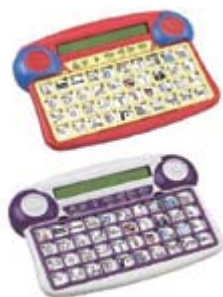
Figure 2. AugmentComm Device

PECS is an alternative communication technique for those who have little or no verbal skills. The PECS consists of a