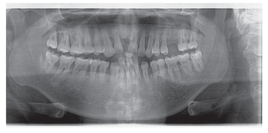
FIGURE 1: Preorthodontic panoramic radiograph with severe radiographic alveolar bone loss present

stratification of risk for patients.<sup>19</sup> Patients at high risk—i.e., those in the grade C category—may require more aggressive preorthodontic interventions, enhanced oral hygiene measures, and more frequent periodontal maintenance during and after active periodontal and orthodontic therapy. If tooth movement is undertaken without addressing the periodontal inflammation, significant loss of