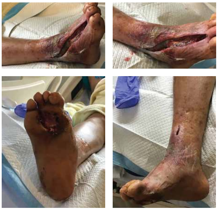
CASE 1: Postoperative result of an incision and drainage for wound salvage in a patient with necrotizing fasciitis.

The American Diabetes Association recommends that patients with diabetes receive